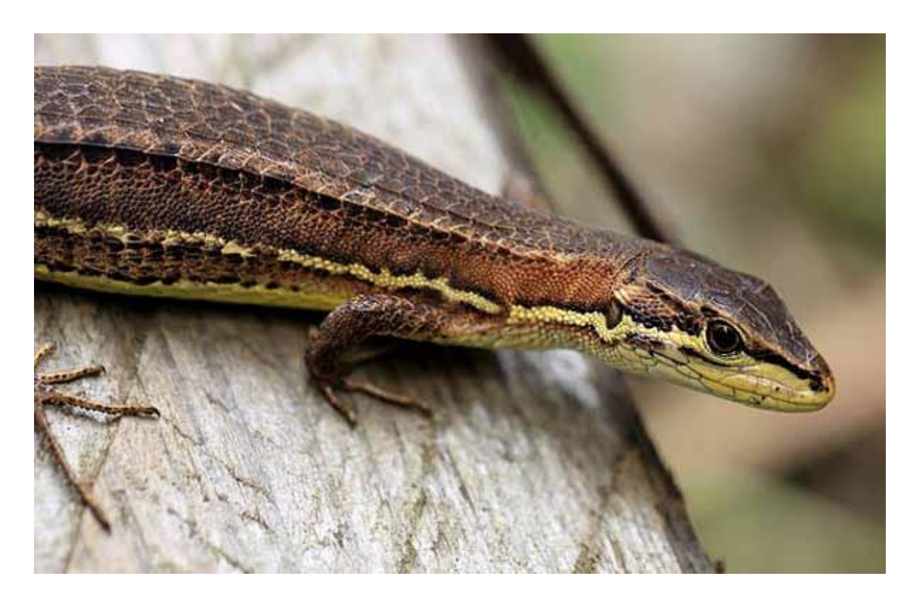
Another view of another Japanese grass lizard (T. tachydromoides). Image by TANAKA Juuyoh, licensed under Creative Commons Attribution 2.0 Generic license.

Arnold (1997) provided a wealth of data on the anatomy of the Takydromus species and produced a morphology-based phylogenetic hypothesis for the clade. As is typical for species that contain numerous species, there have been suggestions from time to time that certain of said species should get their own genera, so both Platyplacopus Boulenger, 1917 and Apeltonotus Boulenger, 1917 are today regarded as synonyms of Takydromus . Arnold (1997) found Takydromus to group into two main clades and he hence suggested that the name Platyplacopus could be applied to the clade that includes its type species ( T. keunei from southern China, Hainan and Taiwan). However, molecular phylogenies have not supported this tidy division and Platyplacopus now seems to be polyphyletic (Lin et al. 2002, Ota et al. 2002). [Image below by <u>TANAKA Juuyoh.</u>]