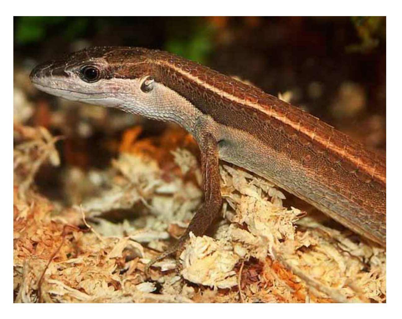
Female T. sexlineatus; image by Acapella, licensed under Creative Commons Attribution-Share Alike 3.0 Unported license.

Takydromus species occur across eastern Asia, from Japan in the north down to Sumatra and Java in the south.