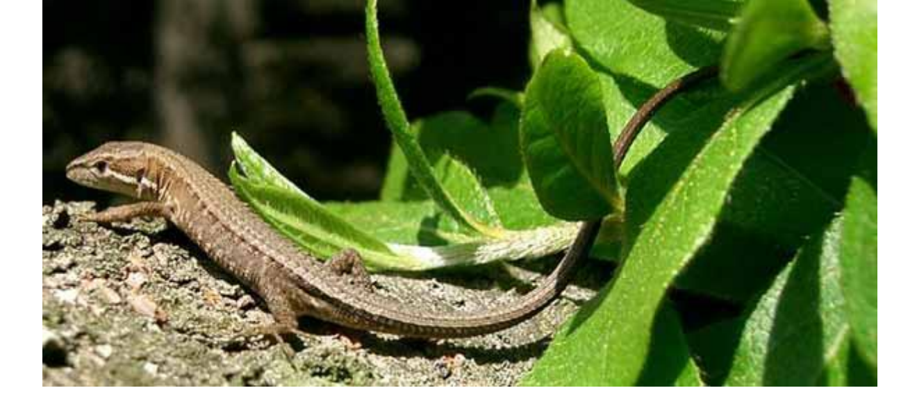
Another Japanese grass lizard (T. tachydromoides) (this species was also reported in 1958 from South Korea)

If you know squamates, you'll know that hemipenis structure is important in working out how species might be related to another. Surprise surprise, Takydromus has weird hemipenes: the lobes at the tips are unusually thick-walled and – so far as we know – the hemipenes don't change shape much across the seasons. Oh yeah, did I say that squamate hemipenes normally change in size and shape according to season? As you might predict, they are biggest and most elaborately ornamented during the breeding season.