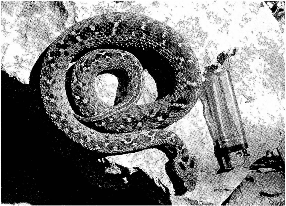
Fig. 5. Vipera xanthina , MCC-ph-00514.

from a dozen localities in W Jordan (DISI et al. 2001). This is the third Syrian specimen and extends the range of the species about 70 km north-east.