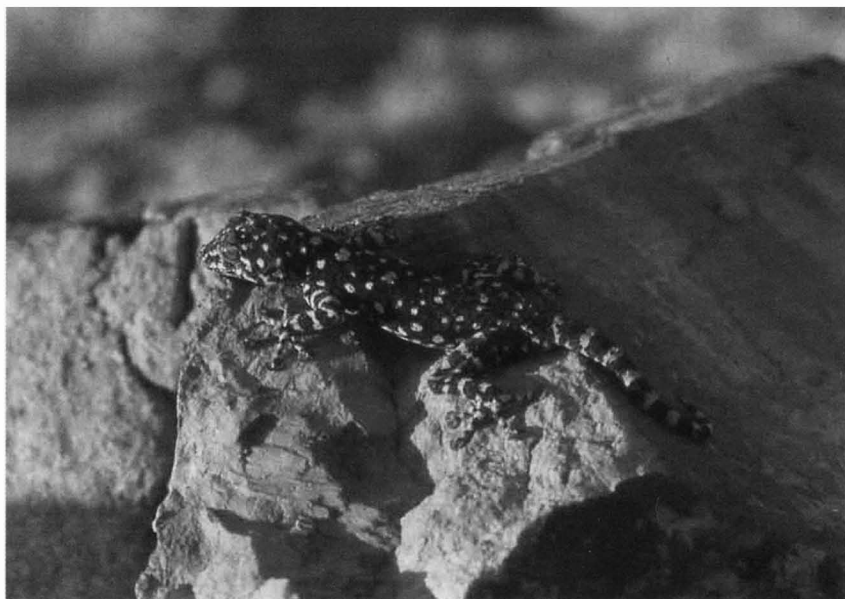
Fig. 1. Acanthodactylus grandis (MZUF 40052).