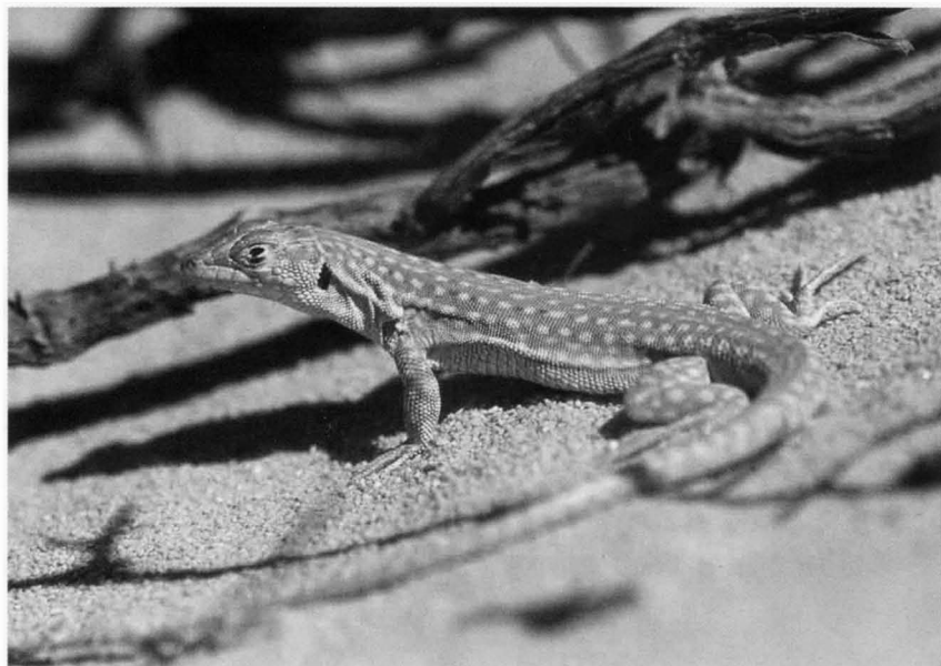
Fig. 2. Ptyodactylus puiseuxi (photographic record MCC-ph-00504).