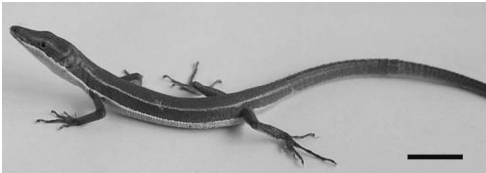
Fig. 2. Male Takydromus sylvaticus in life (HS 030102; SVL=56.5 mm). Scale bar=10 mm.

Limbs slim. Digits long and thin; tips thinner than other sections. Bases of tip sections especially flat, forming an angle to other sections. Each digit equipped with claw and broad subdigital lamellae. Fourth toe with 25–27 subdigital lamellae. Scales on dorsal surfaces of arms enlarged and keeled; ventral scales smooth on lower arms and granular on upper arms. Anterodorsal thigh scales enlarged and keeled, larger than adjacent keeled scales, becoming smaller and granular posteriorly. Smooth and enlarged ventral thigh scales in one row, middle one at least ten times as large as adjacent rounded or granular scales posteriorly. Dorsal tibia scales small and keeled; ventrolateral tibia scales smooth, enlarged in one row, each at least twice as large as adjacent scales. Vent opens transversely. Preanal scale not divided by longitudinal suture (except in specimen HS030102). Continuous series of smaller scales in semicir-