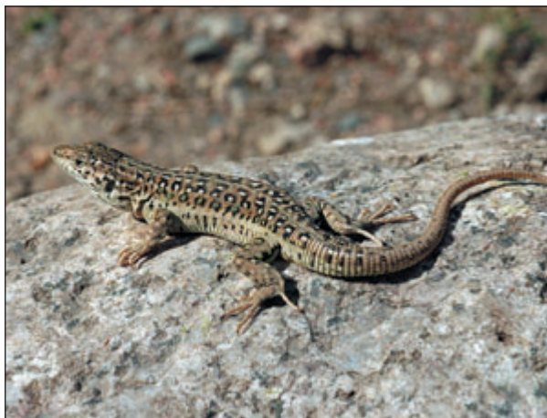
Fig. 4. Male of the racerunner of Eremias multiocellata complex from Kegen River Valley (Central Tien-Shan).