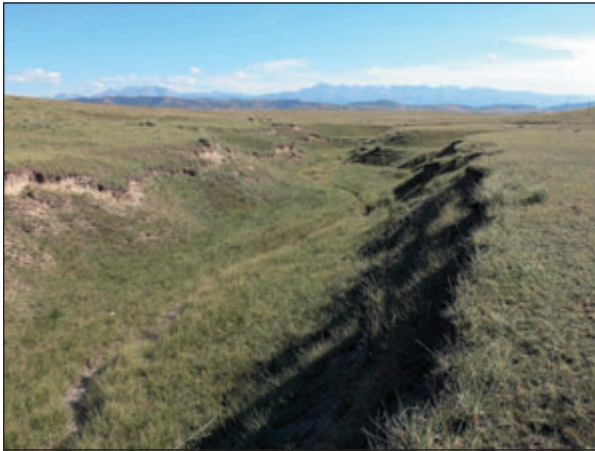
Fig. 2. Biotope of the racerunner of Eremias multiocellata complex in Kegen River Valley (Central Tien-Shan).