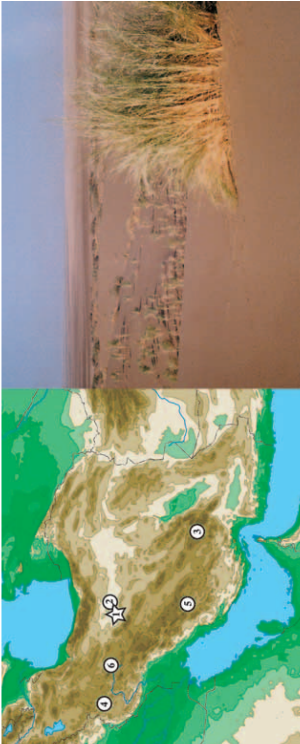
FIGURE 1. On the left, a map showing the localities of restricted-range species of Eremias endemic to Iran. 1 (star): Eremias kavirensis sp. nov.; 2: E. andersoni ; 3: E. talezharrica ; 4: E. montanus ; 5: E. nigrolateralis ; 6: E. novo . On the right, habitat at the type locality of Eremias kavirensis sp. nov.