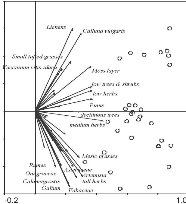
Fig. 2. Principal Component Analysis (PCA) ordination of vegetation plots in Lacerta agilis sites; for vegetation explanations see Table 1.

matic, because plots differed in vegetation cover rather than in taxonomic composition. The PCA first two axes explained 58 % of variation. The first axis (eigenvalue 0.48) could be interpreted as a vegetation cover gradient, and the second (eigenvalue 0.10) – as a vegetation composition gradient. All plots fell into two groups (Fig. 2), and only in respect to the second reflected a composition gradient. Vegetation in both groups was rather similar (Table 1), and both could be separated by relative importance of heath ( Calluna vulgaris ) and grass vegetation. In about 75 % of plots vegetation was dominated by sparse swards of grasses ( Calamagrostis , Poa , Festuca etc.), with presence of other herbaceous vegetation and some low shrubs. Plots were located on different soils, some even on peat, where Lacerta agilis penetrated edges of drained bogs from neighboring dry habitats. In about 25 % of plots vegetation was more closed, dominated by heath ( Calluna vulgaris ) and small, tufted grasses typical for relatively xeric sites ( Festuca ovina agg., Koeleria glauca , Nardus stricta ) on sand. Trees were sparse, low, and dominated by Pinus sylvestris , Betula spp. in both cases. Lacerta agilis habitats with heath are typical for Northern Europe, indicating a specific, dry environment with mosaic vegetation pattern (Dent, Spellerberg 1987; Berglind 2005). However, sites, dominated by grasses, may be more important (Stumpel 1988), confirmed also by the present study.