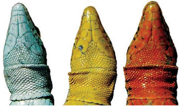
Fig. 1 Three male color morphs of Podarcis melisellensis , the Dalmatian wall lizard.

We noticed a striking polymorphism in ventral coloration in a population of the lizard Podarcis melisellensis on the Croatian island of Lastovo (Fig. 1). Males can have bright white, yellow or orange throats, trunks and bellies. We present data here on the morphology, behavior, performance and ecology of the male morphs, and then relate our findings to predictions of several models invoked to explain the maintenance of color polymorphisms within natural populations.