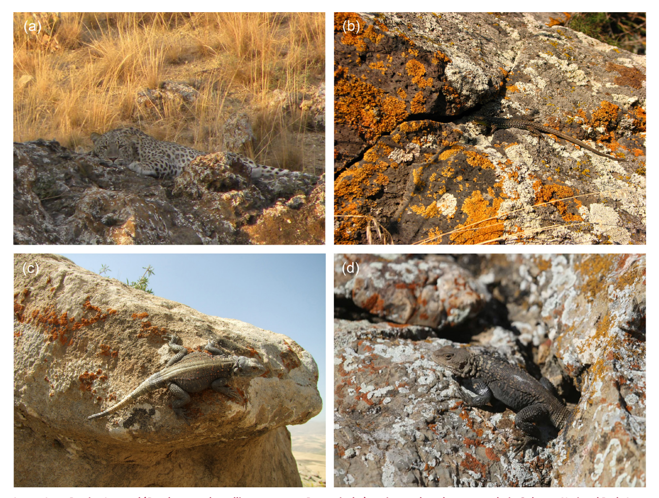
Image 1. a—Persian Leopard ( Panthera pardus tulliana , synonym P.p. saxicolor ) resting on the calcareous rocks in Golestan National Park, Iran. Its coat colors and patterns closely resemble the crustose lichens: Acarospora sp. and Circinaria sp. (© J. Hasanzadeh) | b—represents the background matching of Radde's Rock Lizard ( Darevskia raddei ) on the volcanic rocks in Arasbaran National Park, the lesser Caucasus ecoregion in Iran (© B. Safaei-Mahroo) and the crustose lichens Acarospora sp. and Caloplaca sp. | c—shows Caucasian Rock Agama ( Paralaudakia caucasia ) in an alert position on the calcareous rock, in Iran-Turkey border (Sero). The background matching is enhanced by several crustose lichens: Circinaria sp. and Protoparmeliopsis sp. and Rinodina sp. (© B. Safaei-Mahroo) | d—represents the Caucasian Rock Agama in an alert position, its dorsal coloration resembling the crustose lichens Caloplaca sp. and Circinaria sp. (© J. Hasanzadeh).

To further illustrate the importance of lichens in