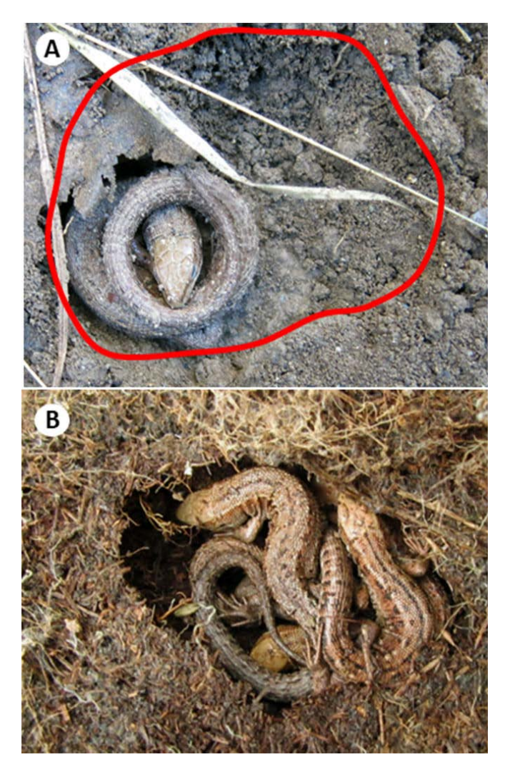
Figure 3 . Viviparous lizards in hibernation cells – A. Adult male in a cell in Nov 2013 (limits of the cell shown by red line) where there is excess space that was originally occupied by a second male last seen in Oct 2013, B. Three common lizards (one adult female and probably two adult males) observed in a hibernation cell beneath a rock in County Antrim, N. Ireland on 19 Oct 2015 photographed by Philip McErlean

This is apparently the first written report of viviparous lizards actively creating a hibernation cell although there are photographs on the internet that look like the same thing. One in particular, by Philip McErlean (Flickr, https://www. flickr.com/photos/64320477@N05/21689021213), is of an adult female and two adult male Z. vivipara (Fig. 3B) in N. Ireland, that were discovered beneath a rock in a cell created in peaty soil suffused with many fine roots. The disposition of these three lizards, more or less filling an ovoid cell, is otherwise identical to that shown for the lizards in Figure 1. Furthermore, what appears to be a hibernation cell has been described in the northern taiga of Western Siberia where a lizard was found in an oval hibernaculum matching the size of the curled animal, positioned about 10 cm deep in a layer of humid peat with partially decomposed roots and wood debris (Bulakhova et al. 2011, quoted in Berman et al., 2016). The creation of a cell in soil with fine roots would be more