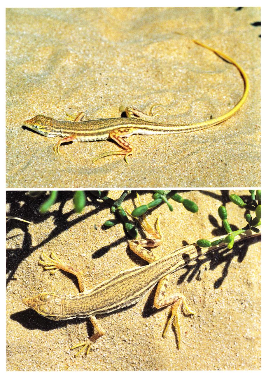
Figs. 216–217: Acanthodactylus haasi, 30 km west of Al Ghaftain guest house, northern Dhofar.