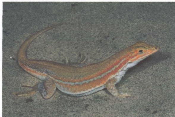
Meroles ctenodactylus —N of Alexander Bay, Richtersveld, NC