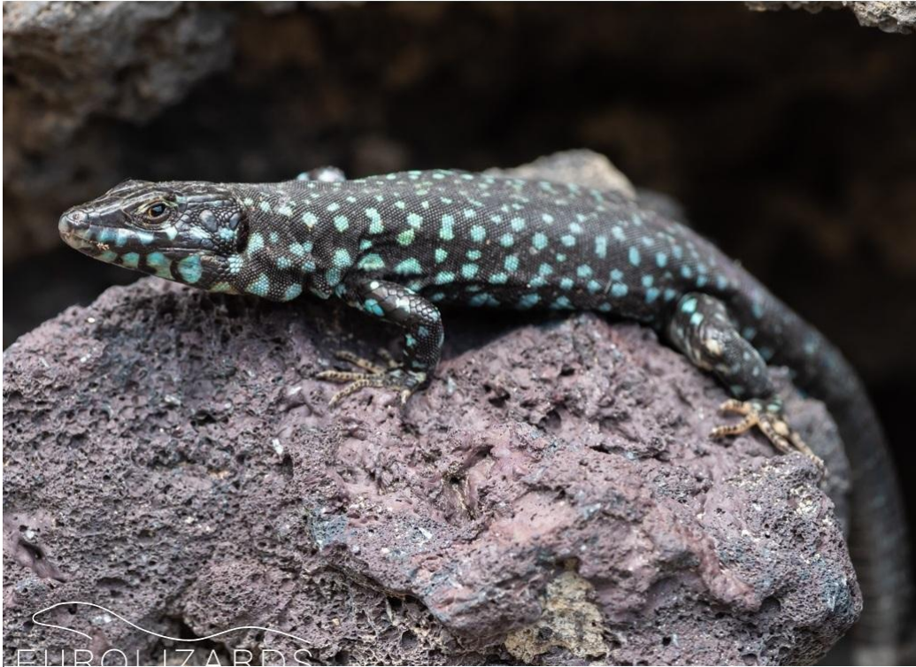
Subsp. laurentiimuelleri, male; I / Linosa, 15.06.2018 - The nominate subspecies from Filfolia Rock south of Malta looks similar.

The Maltese Wall Lizard is maybe one of the most underrated Lacertids in Europe: One might think that it's just another Wall Lizard species - but it's a jewel! Highly variable in pattern, it can show bright yellow and green colours, and the black morphs with blue spots from Filfolia Rock (and Linosa Island) are real stunners.