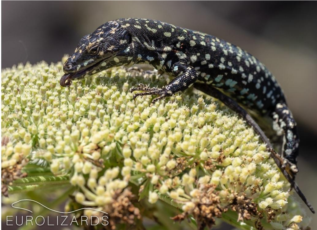
Subsp. laurentiimuelleri, male: I / Linosa, 15.06.2018 - The population of Linosa shows very dark colours.