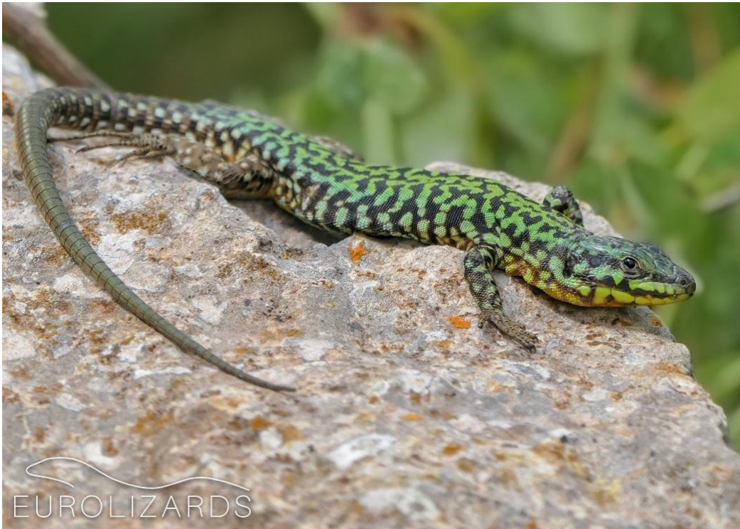
Subspecies maltensis , male: M / Gozo, 04.04.2015 - Specimen from Gozo are highly variable, often showing a heavy black reticulation.