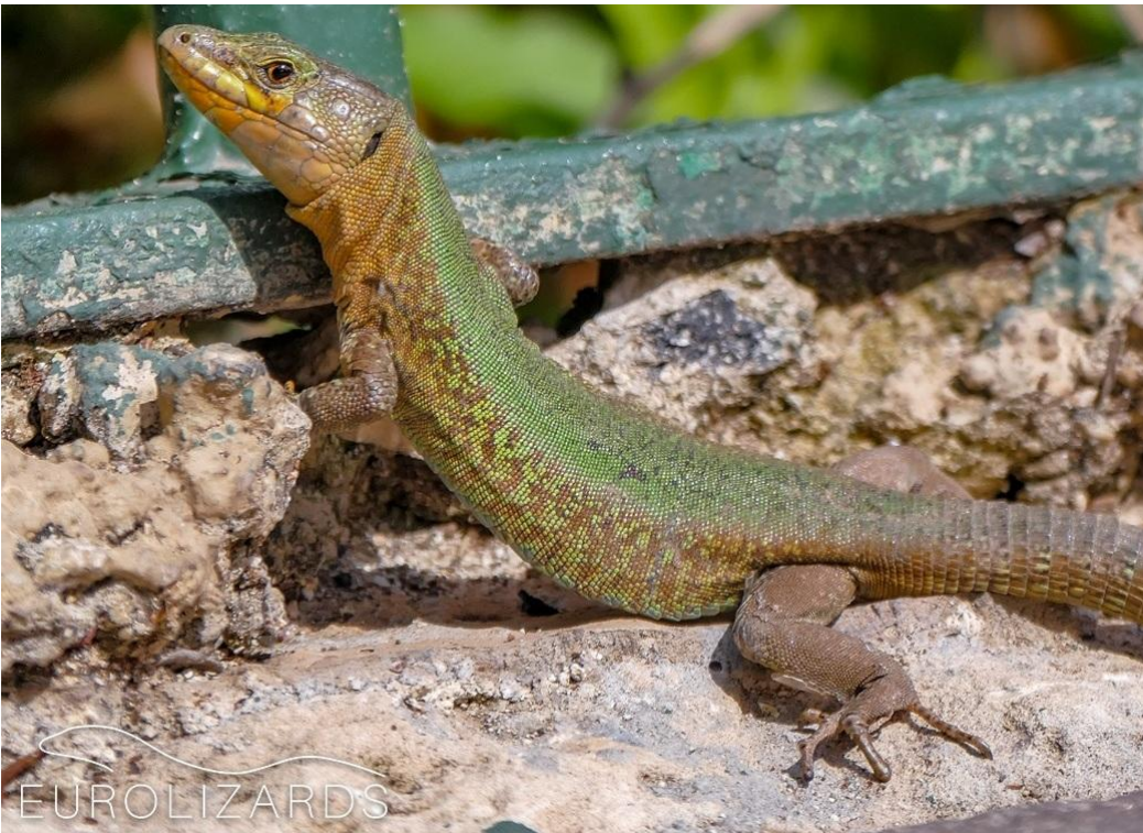
Subspecies maltensis, male: M / Valletta, 03.04.2015 - On Malta, this species often shows pretty green and orange colours.