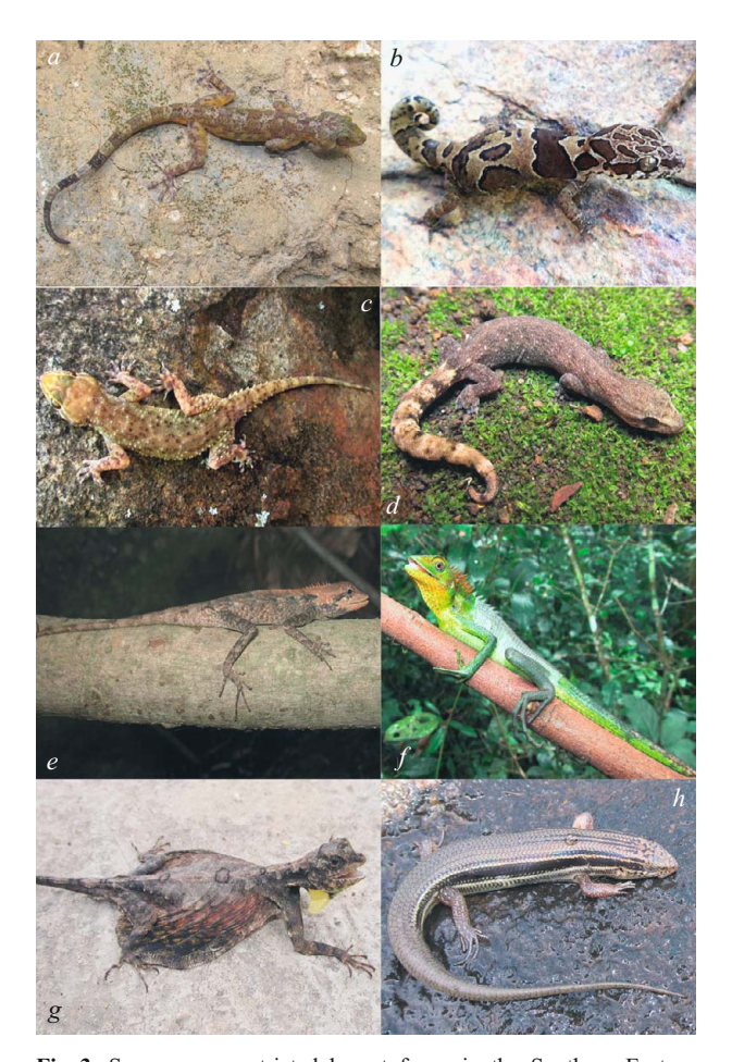
Fig. 3. Some range-restricted herpetofauna in the Southern Eastern Ghats, India: a, Calodactylodes aureus; b, Cyrtodactylus cf. speciosus; c, Hemidactylus cf. acanthopholis; d, Hemiphyllodactylus aurantiacus; e, Calotes rouxii; f, Calotes calotes; g, Draco dussumierii; h, Eutropis beddomii.

Morphology (n = 8). Snout-vent length: 43 - 53 (juvenile 23, subadult 30), tail length: 45 - 65 (juvenile 22, subadult 37), head length: 7 - 10, head width: 6 - 7, head depth: 4 - 6, body width: 10 - 16 (21, gravid), axilla-groin distance: 27 - 32 (juvenile 14, subadult 18), fore limb length: 9 - 10, hind limb length: 10 - 12. Supranasals separated or rarely just touching each other; postnasal present or absent; frontoparietals entire; scalerows 28 - 30, multicarinate dorsally; 4^{th} toe subdigitals 13 - 16. Brown above, laterally black with numerous yellow spots; venter metallic pale bluish white; breeding males with orange red chin and throat; iris brownish red with a black circular pupil.