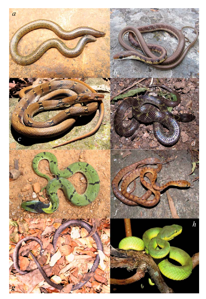
Fig. 5. Some range-restricted herpetofauna in the Southern Eastern Ghats, India: a, Uropeltis dindigalensis; b, Dendrelaphis cf. chairecacos; c, Coelognathus helena monticollaris; d, Lycodon travancoricus; e, Macropisthodon plumbicolor; f, Boiga nuchalis; g, Calliophis beddomei; h, Trimeresurus gramineus.

yellow stripes that conjoin anteriorly at anal scale; tail shield dark brownish gray; black subdermal eye.