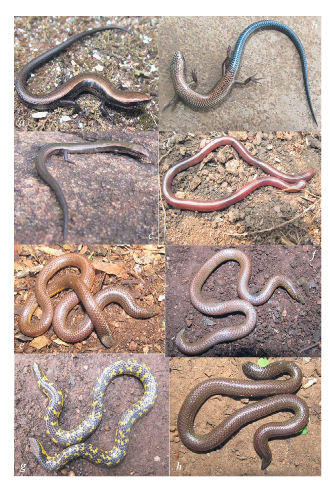
Fig. 4. Some range-restricted herpetofauna in the Southern Eastern Ghats, India: a, Kaestlea sp. (dorsum); b, Kaestlea sp. (venter); c, Lygosoma cf. pruthi ; d, Gerrhopilus cf. beddomei ; e, Rhinophis goweri ; f, Uropeltis cf. ceylanica ; g, Uropeltis shorttii ; h, Uropeltis ellioti .

Recorded from. Jawadi and Shevaroy hills.