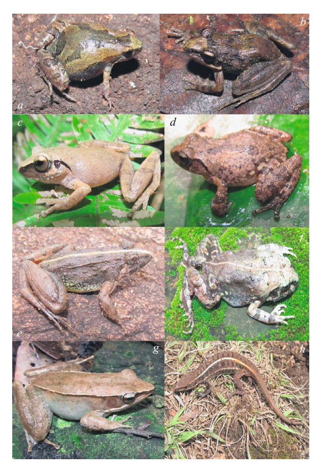
Fig. 2. Some range-restricted herpetofauna in the Southern Eastern Ghats, India: a, Microhyla cf. sholigari; b, Indirana sp.; c, Pseudophilautus cf. wynaadensis; d, Raorchestes cf. leucolatus; e, Fejervarya cf. nilagirica; f, Sphaerotheca cf. dobsonii; g, Hylarana sreeni; h, Ophisops minor nictans.

Morphology (n = 7). Snout-vent length: 48 - 60, head length: 20 - 24, head width: 21 - 25, head depth: 13 - 18, axilla-groin distance: 31 - 37, body width: 20 - 26, fore limb length: 28 - 35, hind limb length: 63 - 74, adpressed tibio-tarsal articulation reaches tympanum. Skin dorsally smooth with some minute warts on trunk and limbs, ventrally smooth except near thighs and groin that are granular; supratympanic fold evident; dorsally yellowish to dark gray with a light vertebral stripe from snout to groin; facial regions below eye dark gray to black with random white blotches; limbs of body color above, barred with dark brown; femoral region and groin