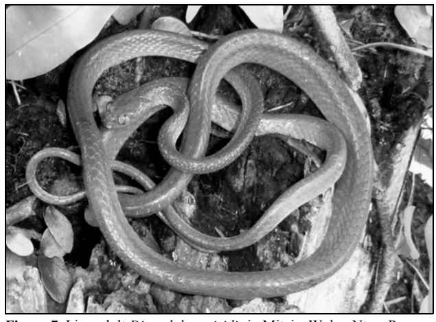
Figure 7 . Live adult Dipsadoboa viridis in Mitzic, Woleu-Ntem Prov., northeastern Gabon.

We report here the second and third known specimens from the core area of Ivindo NP, MSNS Rept 222 and MSNS Rept 238, collected by one of us (PC) at Ipassa on 14 and 19 June 2016, respectively (first specimen recorded by Carlino and Pauwels, 2015). Both were found at around 23:30 in mature secondary forest about 2 km SE of the research station, on tree branches at 50-100 cm above the floor. Both show a vertically elliptical pupil; temporal formula of 1 + 2 / 1 + 2; an anterior pair of sublinguals much longer than the posterior one; a slightly widened vertebral row. In MSNS Rept 238, SRR from 17 to 15 occurs by fusion of 8th row with vertebral row above V 158 (right) and 156 (left) and from 15 to 13 by fusion of rows 3 and 4 above V 158 (left) and 160 (right). On 22 April 2014 LC photographed an adult individual in Mitzic, Okano Dept, Woleu-Ntem Prov. (Figure 7); its uniform green dorsal color, blue ventral and tail color, DSR of 17, frontal longer than wide and single subcaudals allow to readily identify it. New dept