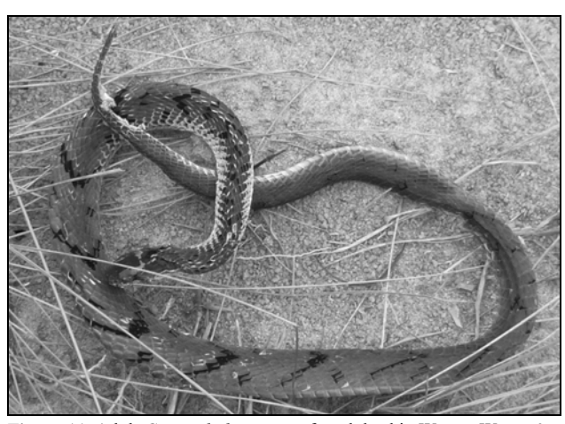
Figure 11. Adult Causus lichtensteinii found dead in Wonga-Wongué Presidential Reserve, northwestern Gabon.

One of us (LC) examined the photograph of an individual of this species taken by an ecoguard at the Camp Présidentiel (0.47736 S, 9.59067 E) in Wonga-Wongué Presidential Reserve, Ogooué & Lacs Dept, Moyen-Ogooué Prov. in June 2014. The same month LC observed another individual at the Camp Présidentiel. Their typical stout habitus, round pupil, blotched dorsal pattern