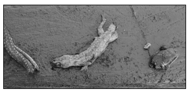
Figure 8. Adult Hapsidophrys smaragdinus in Nyonié, Estuaire Prov., killed with a machete, with one of the three adult Hemidactylus mabouia its stomach contained. On the right side lies the head of the snake.