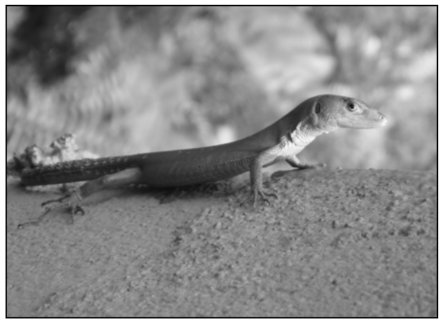
Figure 5 . Live adult Gastropholis echinata photographed by an ecoguard in Wonga-Wongué Presidential Reserve, northwestern Gabon.

the road in Kango, Komo Dept, Estuaire Prov. New locality record (Pauwels et al., 2002b). LC also examined an individual in Ayémé-Maritime, Komo-Mondah Dept, Estuaire Prov., on 27 Dec. 2015. New locality record (Pauwels and Vande weghe, 2008).