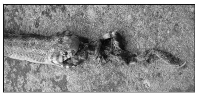
Figure 9 . Adult Naja melanoleuca regurgitating a Sclerophrys regularis in Gamba, Ogooué-Maritime Prov., southwestern Gabon.

MSNS Rept 243: Ipassa, Ivindo NP, Ogooué-Ivindo Prov., 24 June 2016. Caught by one of us (PC) at 20:45 on a branch at one meter above the ground in secondary forest along a road. Temporal formula 2 + 2 on each side. Vertebral row widened. SRR from 19 to 17 occurs above V 149 (left) and 146 (right) by fusion of rows 3 and 4 on each side; from 17 to 15 above V 150 (left) and 147 (right) by fusion of row 8 with vertebral row on each side. This is the second specimen recorded from Ivindo NP. Like the first one (Carlino and Pauwels, 2015) it has 19 DSR at midbody; Pauwels and Vande weghe (2008) had only recorded Gabonese specimens with 21 DSR at midbody. Based on the extensive molecular phylogeny by Figueroa et al. (2016) we accept the allocation of the African species previously referred to Boiga by us and other authors to Toxicodryas .