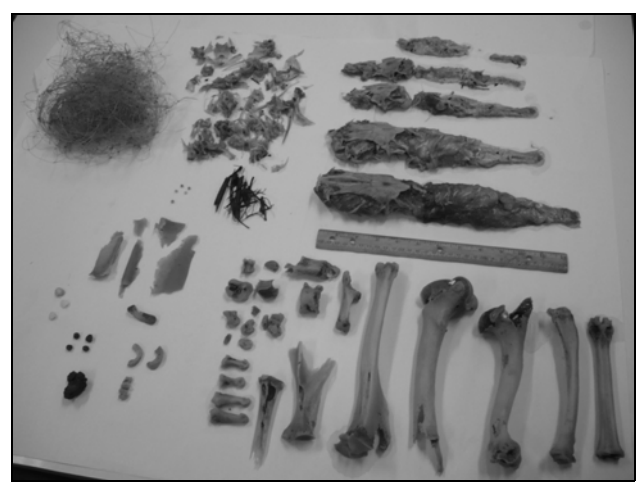
Figure 2 . Stomach contents from the Nile crocodile shown in Figure 1. The ruler is 30 cm long.

which was entangled in their fishing nets in Ndogo Lagoon (secteur Koumaga), Ndougou Dept, Ogooué-Maritime Prov. They called the teams of WWF Gabon (BH) and the Brigade de Faune (TBBE) for help, but the crocodile could not be saved in time and drowned. Its body was brought on land and measured (TEJL, OSGP, ET) (Figure 1). Its SVL was 231 cm; its total length was 440 cm, but the tail tip was missing and healed. Possibly due to old age, it had no teeth left, except one on the left lower jaw, under the middle of the orbit. The crocodile was dissected and its stomach contents were analyzed (TEJL, OSGP, WVN). They included bones of a sitatunga (Mammalia: Cetartiodactyla: Bovidae: Tragelaphus spekii Speke, 1863), five Arius latiscutatus Günther, 1864 (Siluriformes: Ariidae; longest one 37 cm of total length), varied small parts of vegetal matter (including reeds, probably incidentally ingested), one gastrolith, four gun bullets (lead shot), and part of the fishing net (surface ca. 60×80 cm, 5×5 cm mesh) which caused its drowning (Figures 2 and 3). The presence of five conspecific fishes and part of the