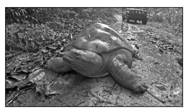
Figure 4. Live adult Trionyx triunguis near Nyonié, Estuaire Prov., northwestern Gabon.

Agama lebretoni Wagner, Barej & Schmitz, 2009 MSNS Rept 119: Iboundji City, Offoué-Onoy Dept, Ogooué-Lolo Prov., Nov. 2012. Caught by day on a house wall in the city. Adult female. SVL 119 mm; TaL > 121 mm (tip missing, healed); 51 midline vertebral scales from midpoint above pectoral region to midpoint above pelvic region (58 to a point above