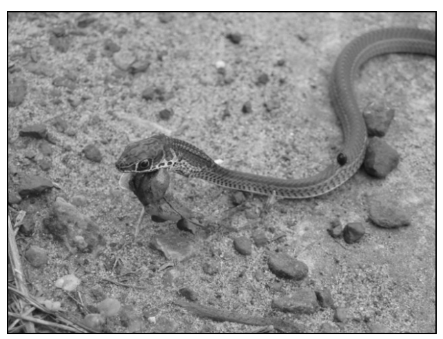
Figure 10 . Juvenile Psammophis cf. phillipsii eating an adult Phrynobatrachus auritus in Gamba Oil Terminal, Ogooué-Maritime Prov., southwestern Gabon.