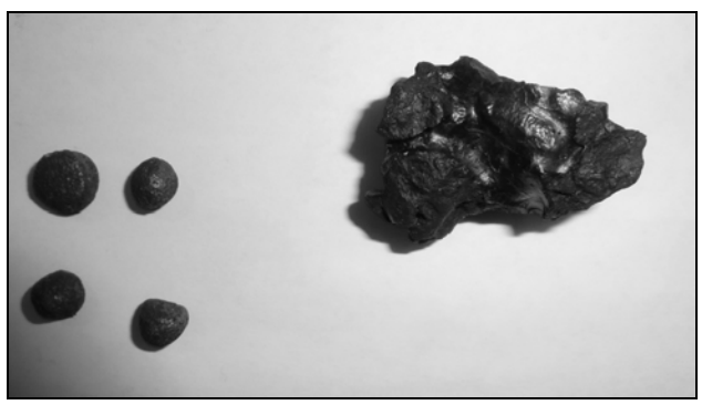
Figure 3 . Gastrolith and lead bullets, part of the stomach contents from the Nile crocodile shown in Figure 1.

net in its stomach indicates that it was attracted by the fish caught in the net. The spherical lead bullets had a maximum diameter of 7 to 10 mm. They probably served to injure or kill the sitatunga. The sitatunga is the most widespread bovine in Gabon and is well known in this locality (Christy et al., 2007; Vande weghe et al., 2016). The Rough-head sea catfish Arius latiscutatus is common in Ndogo Lagoon and frequently found in nets (Mamonekene et al., 2006). The gastrolith was composed of limonite; it had a maximum length of 35.0 mm, a maximum width of 30.0 mm and a mass of 15.0 g. Although the crocodile individual could not be weighted, it is clear that the mass of this single gastrolith was so small relative to the crocodile's total mass that it was unlikely to serve a hydrostatic function, similarly to what was concluded based on the analysis of gastroliths from Mecistops cataphractus and Osteolaemus tetraspis individuals caught in the same province (Pauwels et al., 2007a, b). This Nile crocodile individual was so exceptionally large for Gabon that it had been reported in popular online media (Anonymous, 2010). Commercial hunting of Nile crocodiles for their skin was very intensive in Gabon until the mid-70s; hunting for their meat still occurs (Pauwels, 2006), and large individuals are rare today.