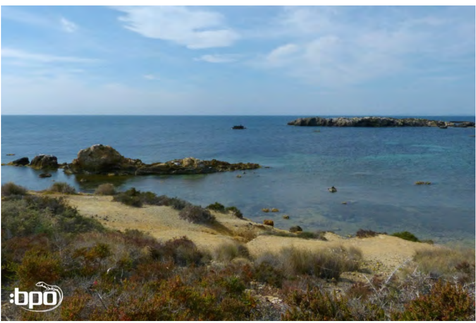
Habitat on Tabarca island...