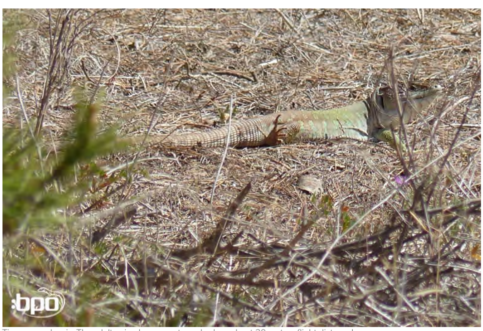
Timon nevadensis: The adult animals were extremely shy - about 30 meters flight distance!