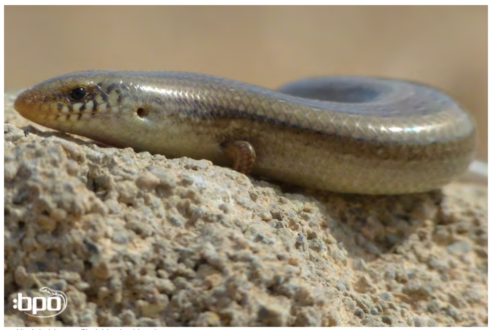
and its inhabitants: Chalcides bedriagai...