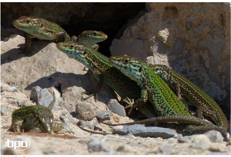
All You Can Eat...

The province of Alicante is home of about 20 reptile species. This sounded pretty promising for us and highly motivated we started herping. Our first goal was a dune area south of Santa Pola. There, our target species was Acanthodactylus erythrurus: We didn't have good pictures of adult animals of this species so far - now we had the opportunity. The area proved to be quite efficient: we found six species at this place.