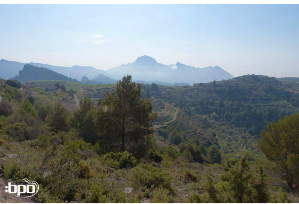
A nice mountain habitat - but where are the reptiles?

The mountains of the northern province of Alicante are one of the few areas in Europe where even in winter numerous reptiles can be found. Now, in spring we had high expectations: We expected the lizards and snakes to literally stand in line to be photographed by us. To our surprise, we found significantly fewer reptiles than in winter, even the very common Podarcis liolepis proved to be less abundant than expected.