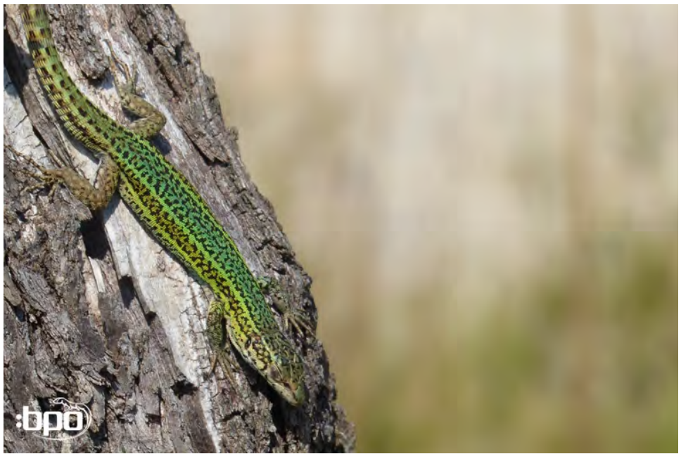
Sleeping Podarcis liolepis