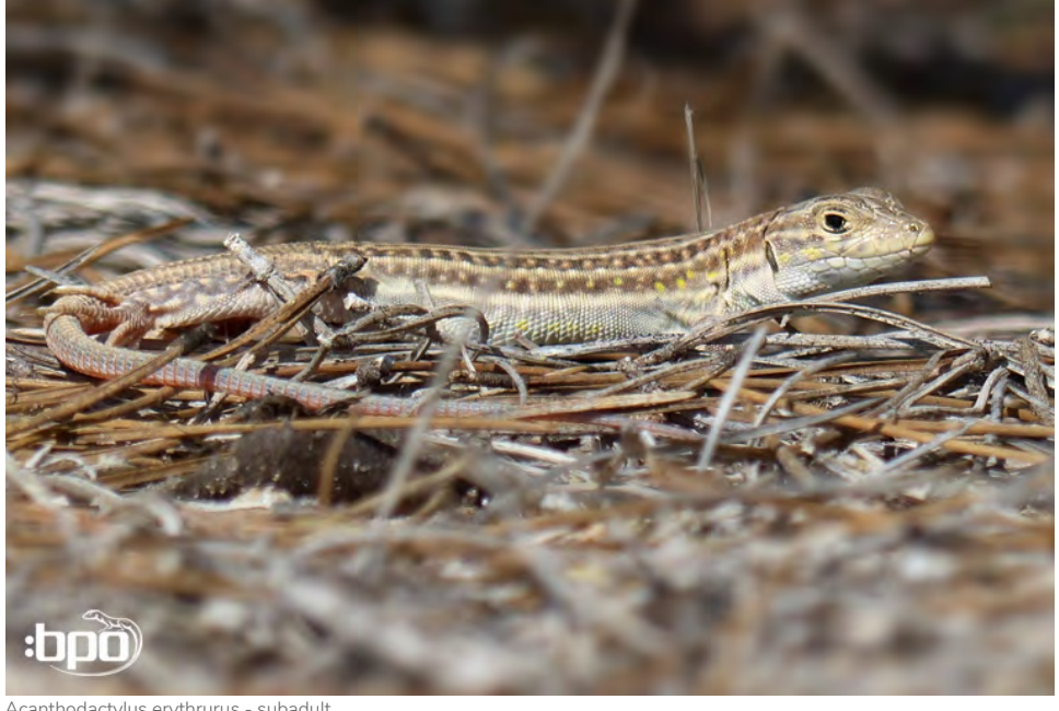
Acanthodactylus erythrurus - subadult