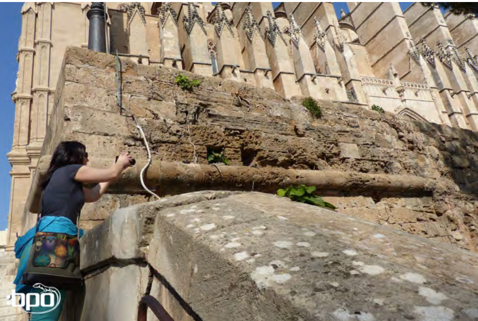
City-herping in Palma de Mallorca