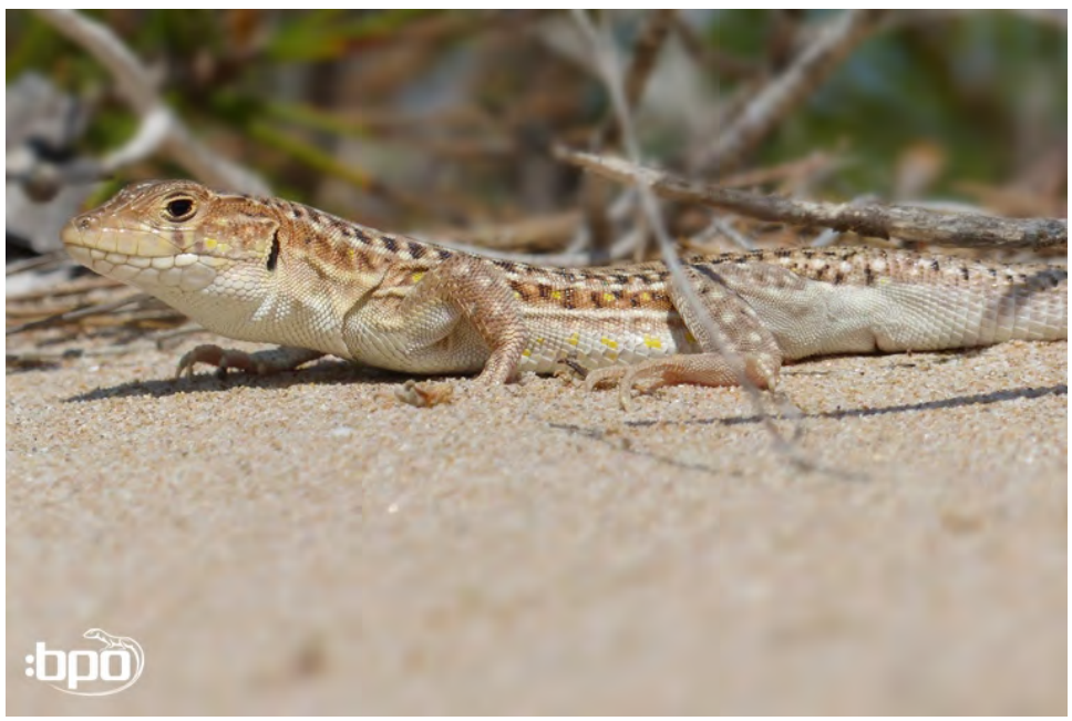
Acanthodactylus erythrurus - adult