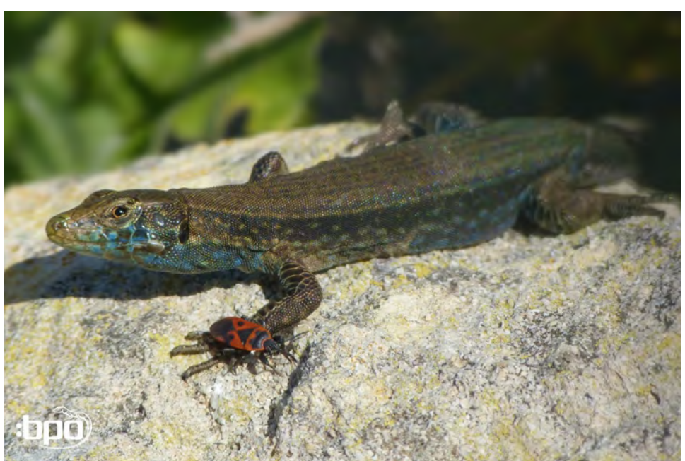
Podarcis lifordi with fashionable accessory on its wrist