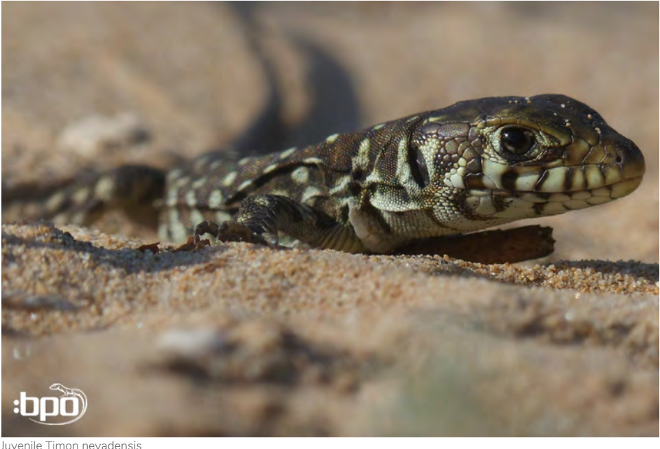
Juvenile Timon nevadensis