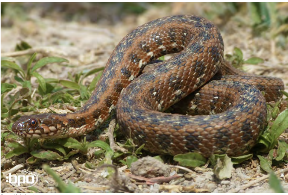
Beautiful Natrix maura