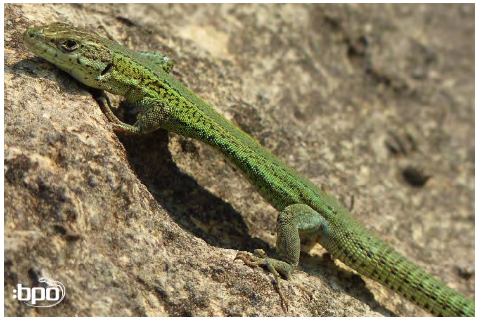
Pancake position: Podarcis liolepis warming up in the sun