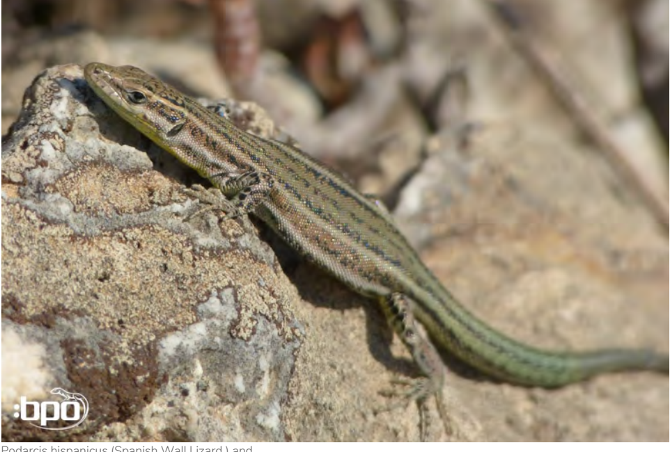
Podarcis hispanicus (Spanish Wall Lizard ) and...