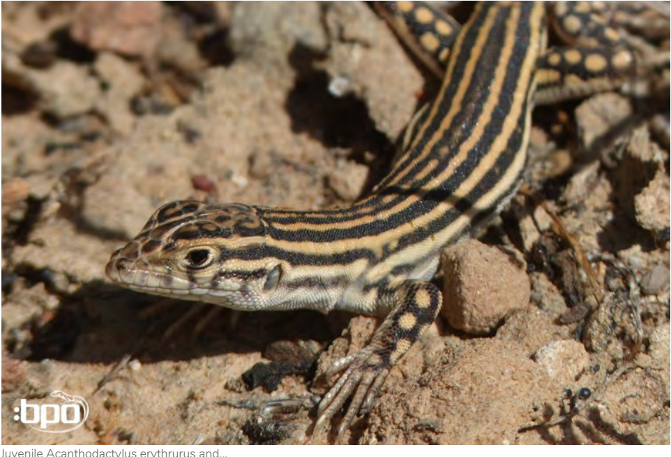
Juvenile Acanthodactylus erythrurus and...