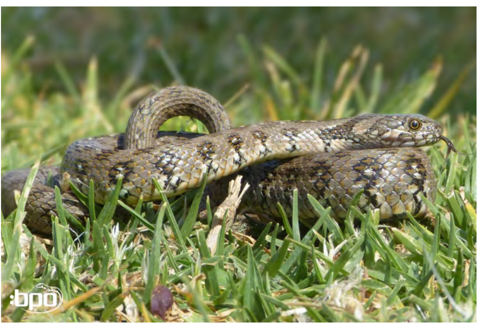
Another Natrix maura

In the morning, we explored a coastal section where Podarcis hispanicus occurs. Here, we almost stumbled over an adult Malpolon monspessulanus - an impressive, large snake! In the afternoon we went to Torrevieja, a place with more than 100.000 inhabitants in a post-apocalyptic touristic scenery: an insider tip for all who want to spent their holidays between English sports bars, Chinese fast food restaurants and Indian souvenir shops. The lagoon of La Mata, a nature reserve, is situated like an island in between the hotels and appartments. There, we could take some more pictures of Acanthodactylus erythrurus. In the evening, we left the coast and moved to the mountains of northern Alicante province where we hoped to find further reptile species.