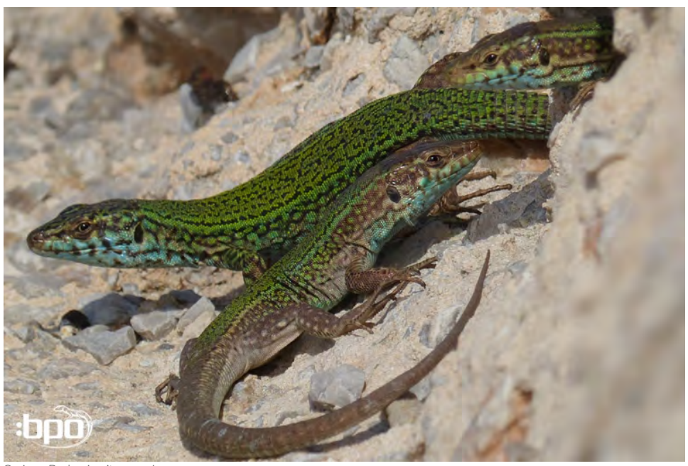
Curious Podarcis pityusensis