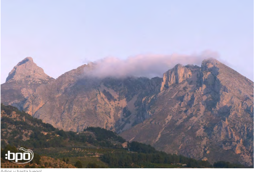
Adios y hasta luego