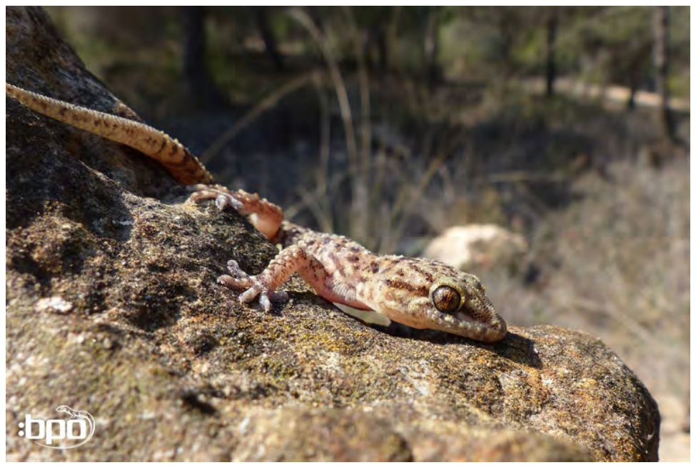
onsense #2: Hemidactylus turcicus - sunbasking animals rarely seen