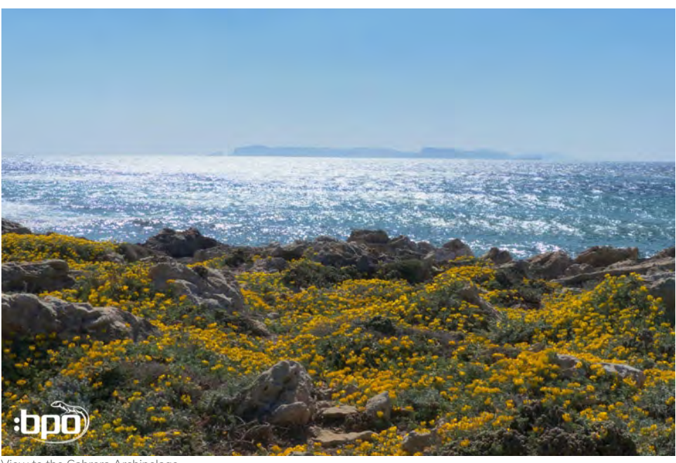
View to the Cabrera Archipelago