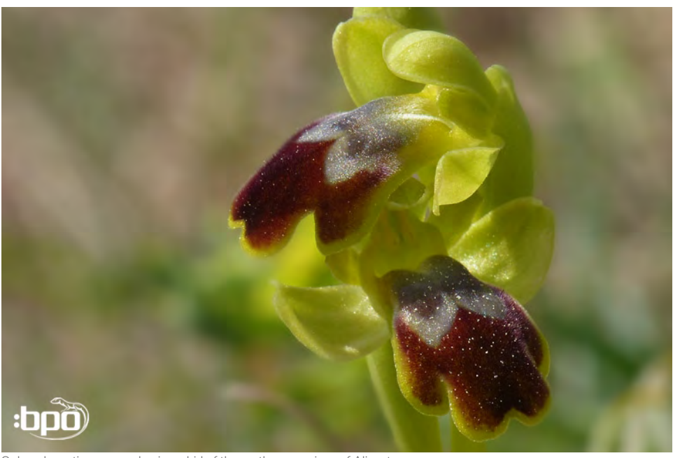
Ophrys lucentina - an endemic orchid of the northern province of Alicante