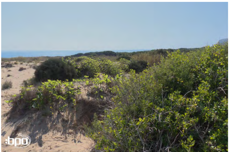
The coast near Santa Pola - habitat of...