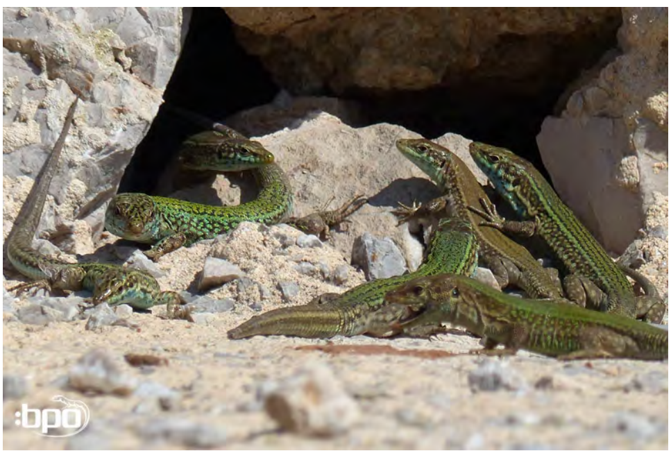
Did anyone here drop a chocolate cookie?