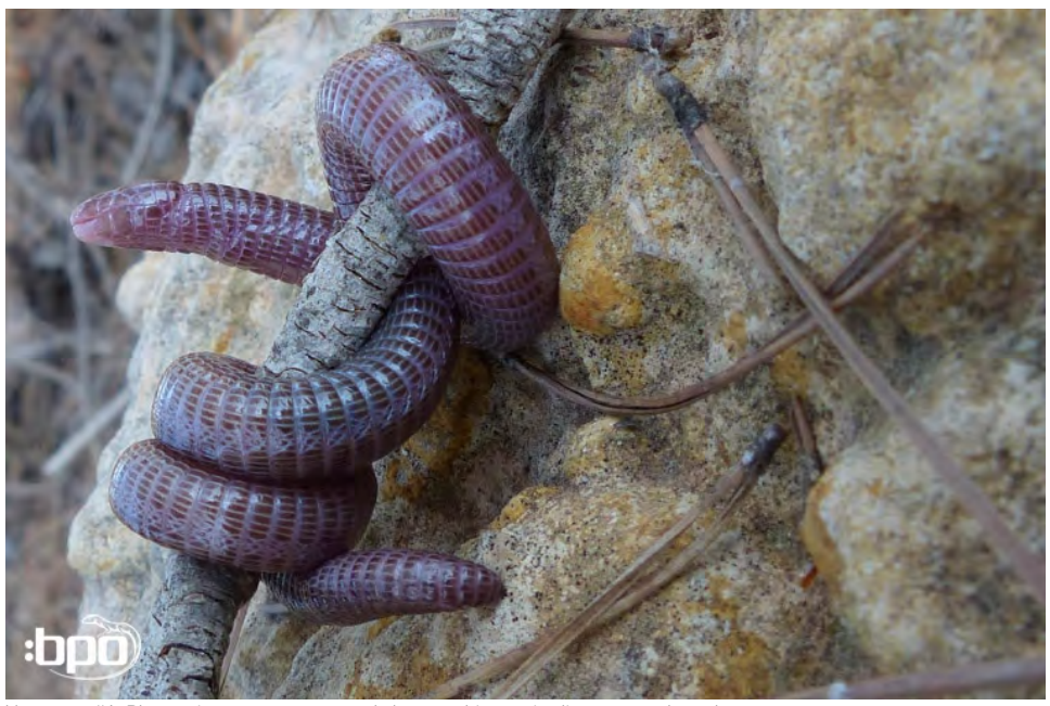
Nonsense #1: Blanus cinereus - as commonly known, this species lives on tree branches