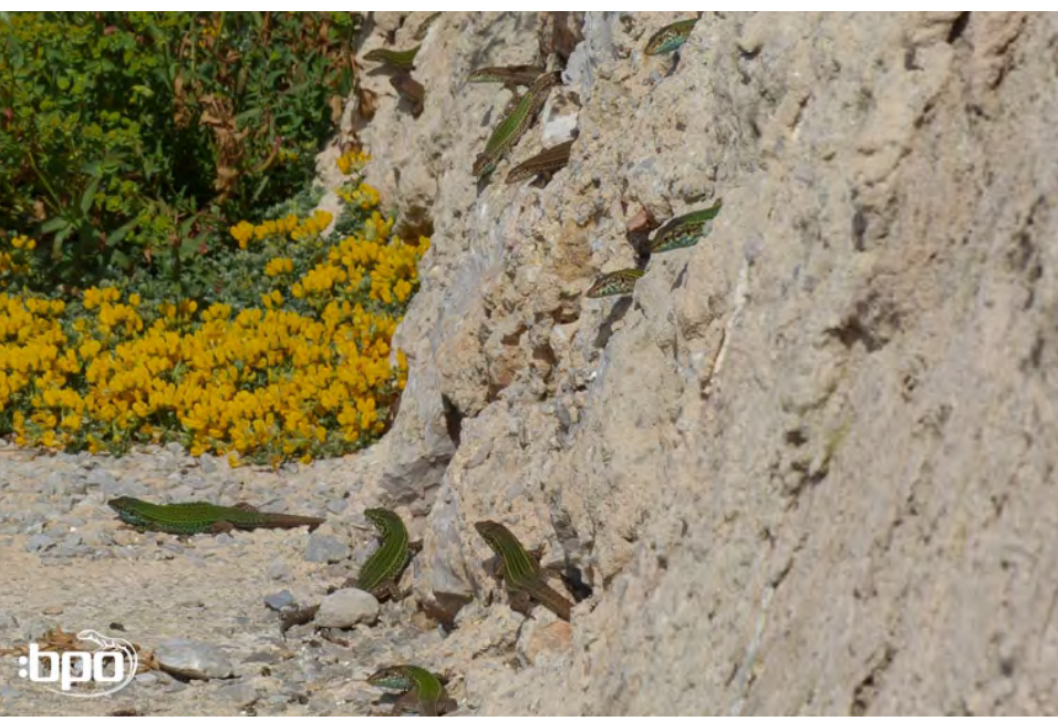
A wall full of lizards