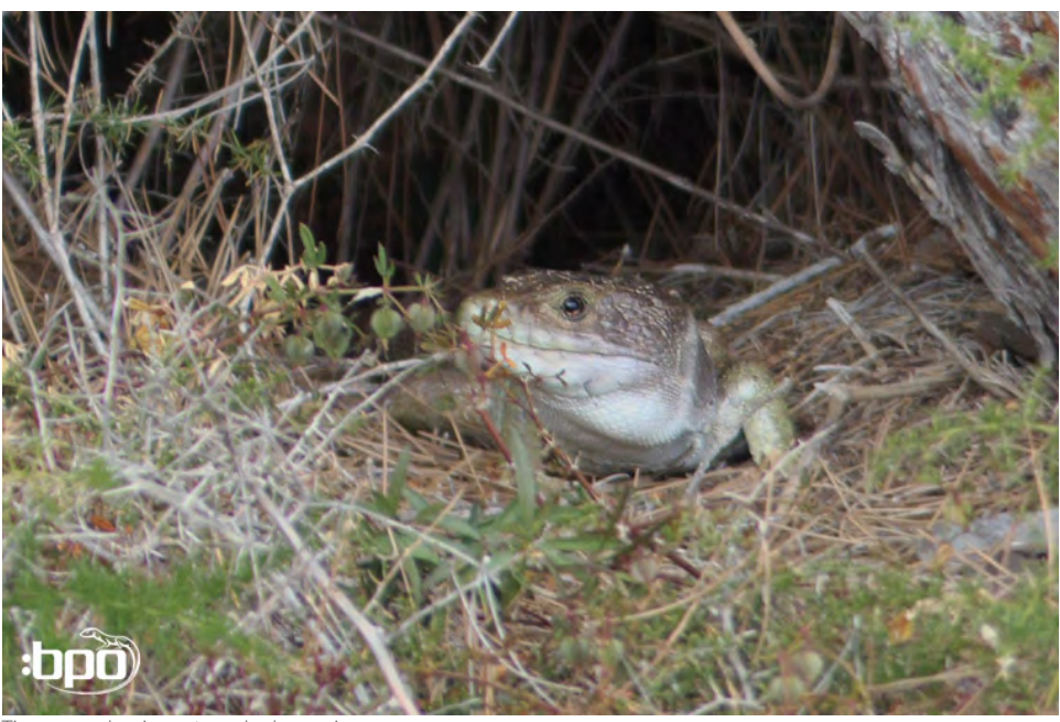
Timon nevadensis - extremely shy, again