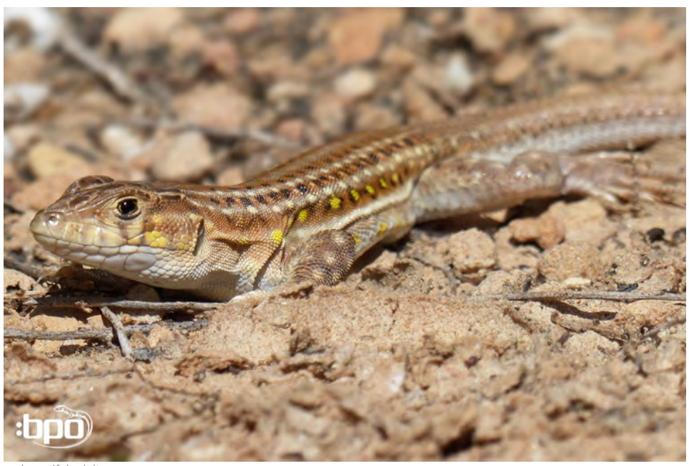
...a beautiful adult

The mountains of the northern province of Alicante are one of the few areas in Europe where even in winter numerous reptiles can be found. Now, in spring we had high expectations: We expected the lizards and snakes to literally stand in line to be photographed by us. To our surprise, we found significantly fewer reptiles than in winter, even the very common Podarcis liolepis proved to be less abundant than expected.