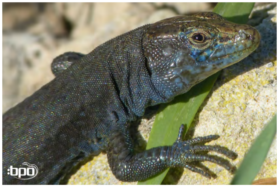
With a little patience, beautiful portrait shots were possible