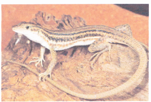
Pedioplanis namaquensis—Farm Slangfontein, between Wolwefontein and Jansenville, EC