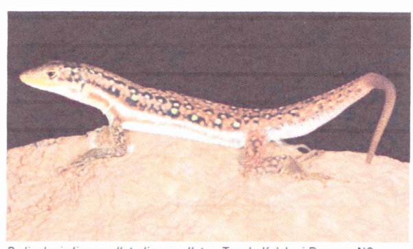
Pedioplanis lineoocellata lineoocellata—Tswalu Kalahari Reserve, NC W. Conradie