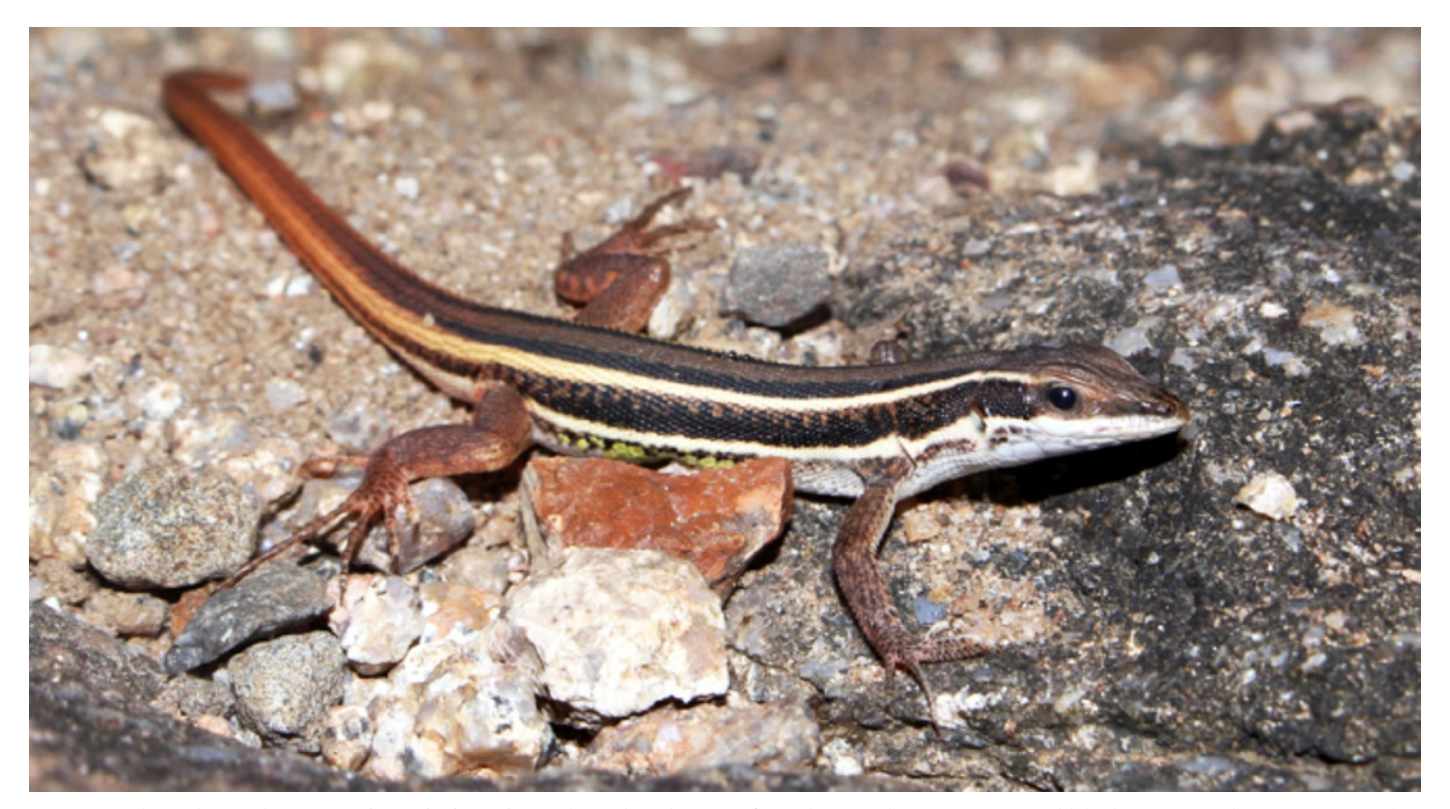
Fig. 1. Leschenault's Snake Eye, Ophisops leschenaultii (Milne-Edwards 1829) from the Kawal Tiger Reserve, Adilabad District, Telangana State, India.

divergence suggest a late Miocene diversification within the genus (Kyriazi et al. 2008). Although that phylogenetic study focused on the two Mediterranean species ( O. elegans and O. occidentalis ), one individual of O. jerdonii collected in India was included in the study. It showed a high degree of divergence from all other clades. Studies pertaining to the genus Ophisops in the Indian subcontinent, like those more broadly in Asia, are still in a nascent stage.